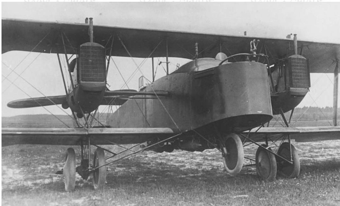
A FRIEDRICHSHAFEN G.IIIa

A rare WW1 German aircraft identification plate