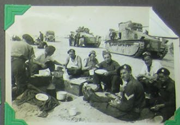
GRUB UP COME AND GET IT.