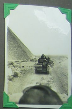
ROYAL TANK CORPS PASSING