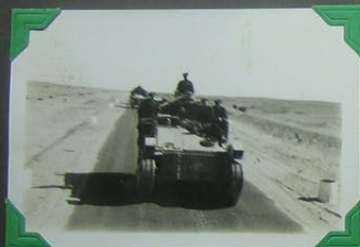
ALONG THE SUEZ ROAD