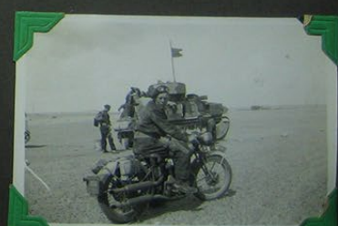
OH TO BE A D.R.