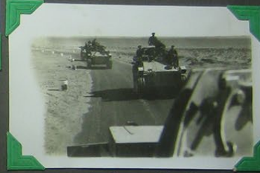
DOWN THE SUEZ ROAD.