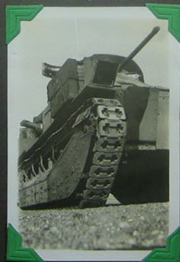
SIDE VIEW OF TANK TRACK