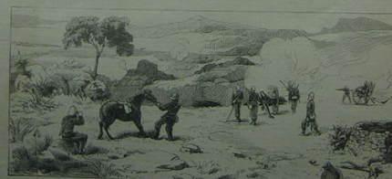
THE ZULU WAR