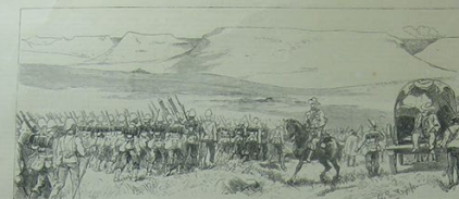
SCENE OF THE BATTLE OF ISANDLWANA, 22ND JULY 1879