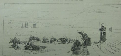
SCENE OF THE BATTLE OF ISANDLWANA, 22ND JULY 1879