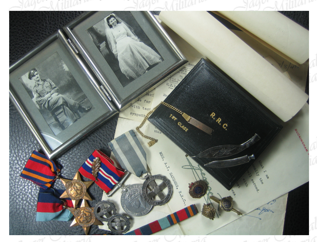
Royal Red Cross 1st Class London Gazette 6 June 1946. The recommendation from 31 December 1945 states:

AN EXTREMELY FINE GROUP TO A HIGHLY DECORATED NURSE IN THE INDIAN MILITARY NURSING SERVICE ROYAL RED CROSS 1ST AND 2ND CLASS AND MID GROUP WHO ALSO RECEIVED A RARE BURMA DECEMBER CAMPAIGN 1941 - MAY 1942 CERTIFICATE FOR THE CAMPAIGN FROM THE GOVERNOR OF BURMA; COMMENDED FOR REFUSING TO LEAVE HER PATIENTS DURING A BOMBING RAID.