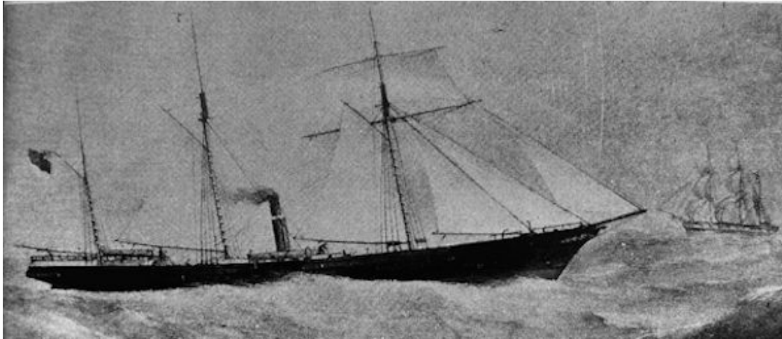
Hope 1854. Chartered to the British Government

http://www.historic-shipping.co.uk/african/hope.html